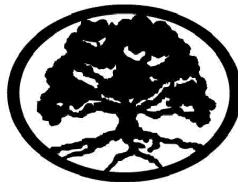
Membership means success

At the Annual members meeting you heard a Pasco County deputy mention the importance of having your house number in a prominent location such that, when seconds count, emergency services isn't cruising right by your house because they can't see the number easily.